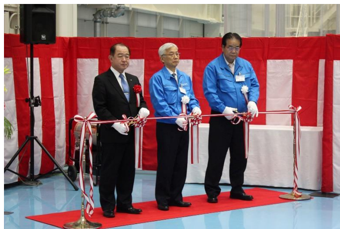
Ribbon-cutting at the opening ceremony attended by Mayor of Zama