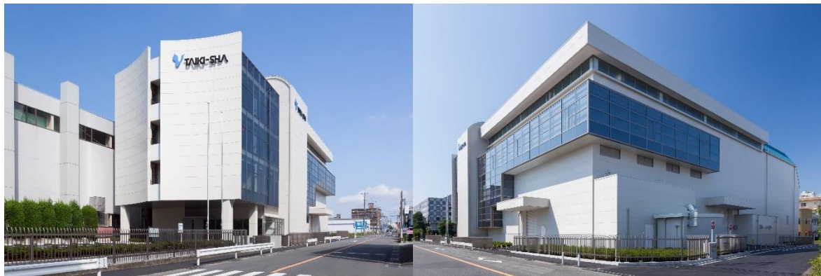
Exterior Appearance of the Technical Center